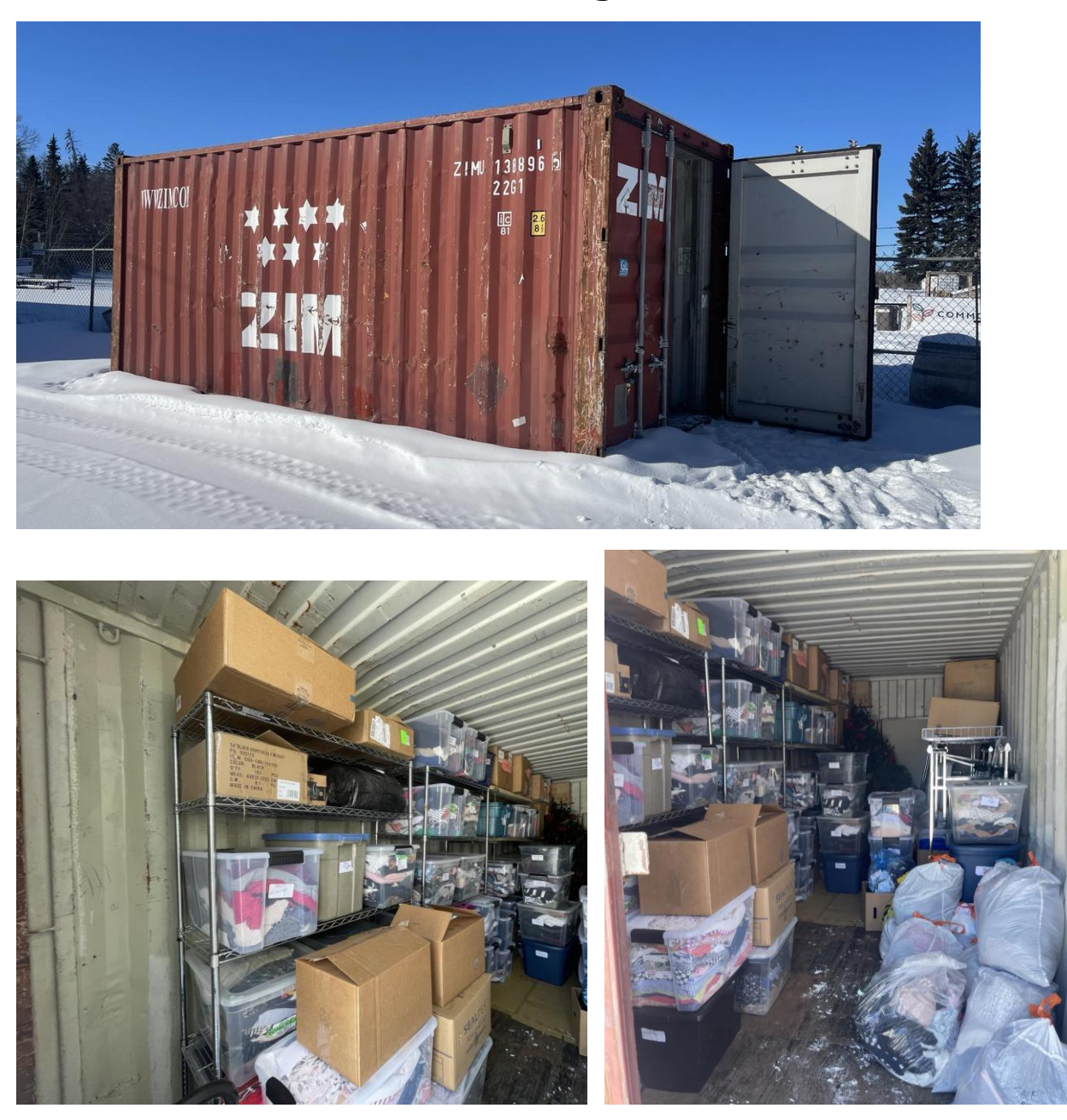
Sea Can - Overflow Seasonal Storage Area

CURRENT USE: Additional storage for seasonal items and sales clothes, including some office items.