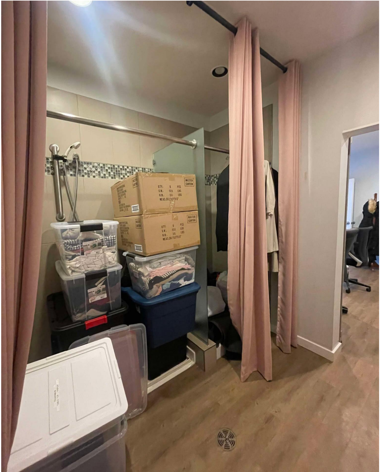
Overflow Storage Area – Previously Shower Space